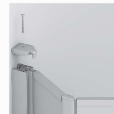
Wall fixing TENPFM