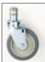
HD Super Stem Caster

Stainless solid shelving has black powder-coated corners. Galvanized solid shelving has uncoated cast corners.