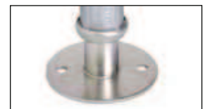
3 1 / 2 " (89mm) Foot Plate

3 1 / 2 " (89mm) Foot Plates Cat. No. 9993HS