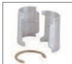
Replacement HD Super™ Aluminum Split Sleeve

Replacement HD Super™ Aluminum Split Sleeves with Zinc Ring 4 pair per bag Cat. No. 9986HZ