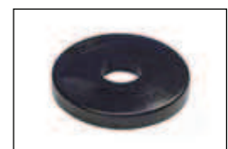
Replacement 5 1 / 2 " (140mm) Donut Bumper

Cat. No. 9992Hh Above fit 1 5 / 8 " (41mm) posts only.