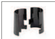
Replacement HD Super™ Plastic Split Sleeve

Replacement HD Super™ Plastic Split Sleeves 4 pair per bag Plastic — Cat. No. 9985H