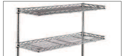
HD Super™ Cantilever Shelf

Note: Not compatible with Super Erecta or Super Adjustable Super Erecta components.