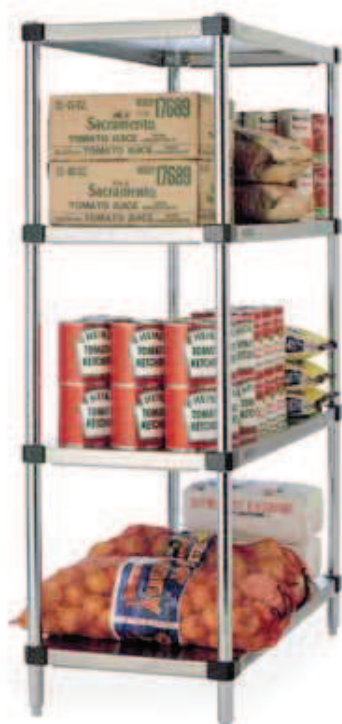
HD Super Solid Stainless Shelving with black powder-coated corners

Load rating per caster: 400 lbs. (182kg).